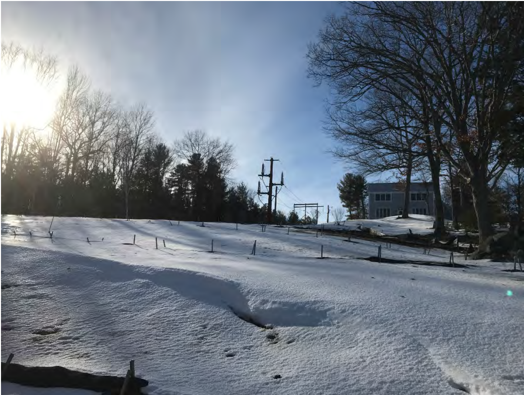
Fig 3: Slope above the cable house at the Eversource property/west side of the bay. Viewing southwest. (02-17-21)