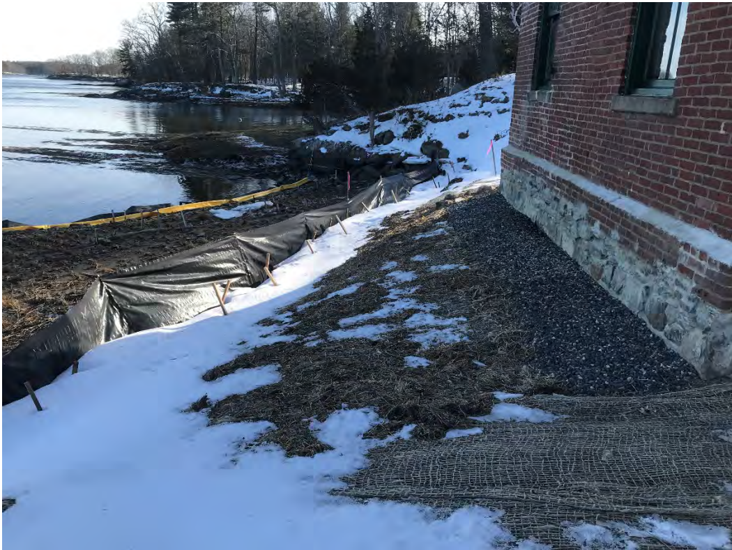
Fig 2: Slope between the cable house and salt marsh restoration at the Eversource property/west side of the bay. Viewing south. (02-17-21)