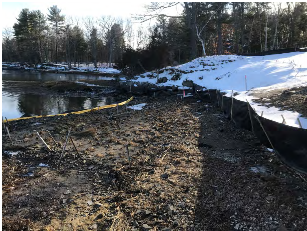
Fig 4: Toe of the slope and salt marsh restoration at the Eversource property/west side of the bay. Viewing south. (02-17-21)