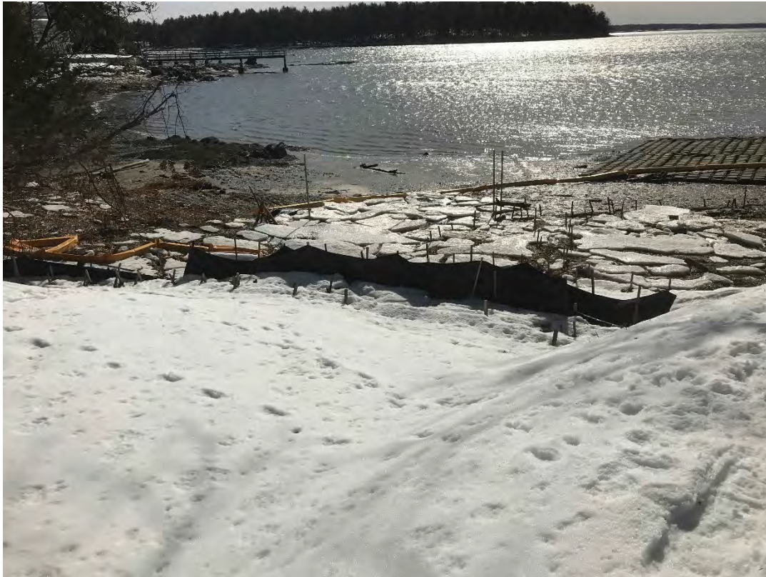
Fig 11: Toe of the slope at Gundalow Landing/east side of the bay. Viewing south. (02-17-21)