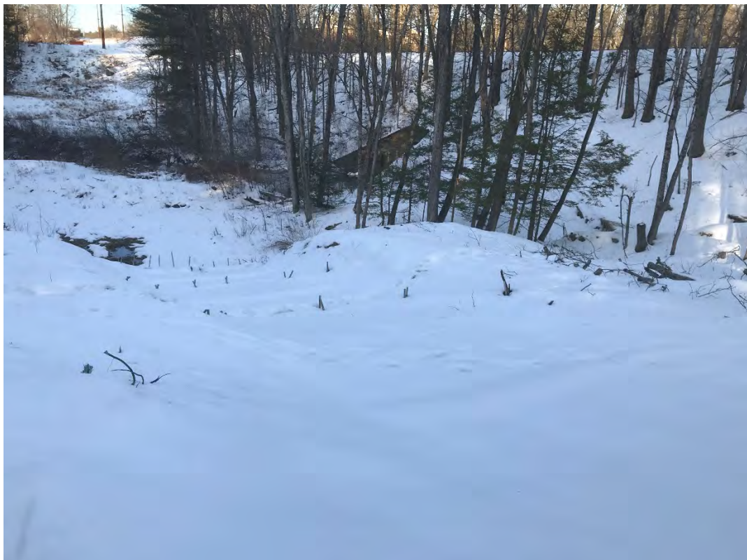
Fig 8: Lower portion of slope between Strs. 28 and 29. Viewing northeast. (02-17-21)