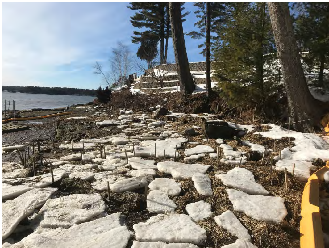
Fig 12: Salt marsh restoration at Gundalow Landing/east side of the bay. Viewing northwest. (02-17-21)