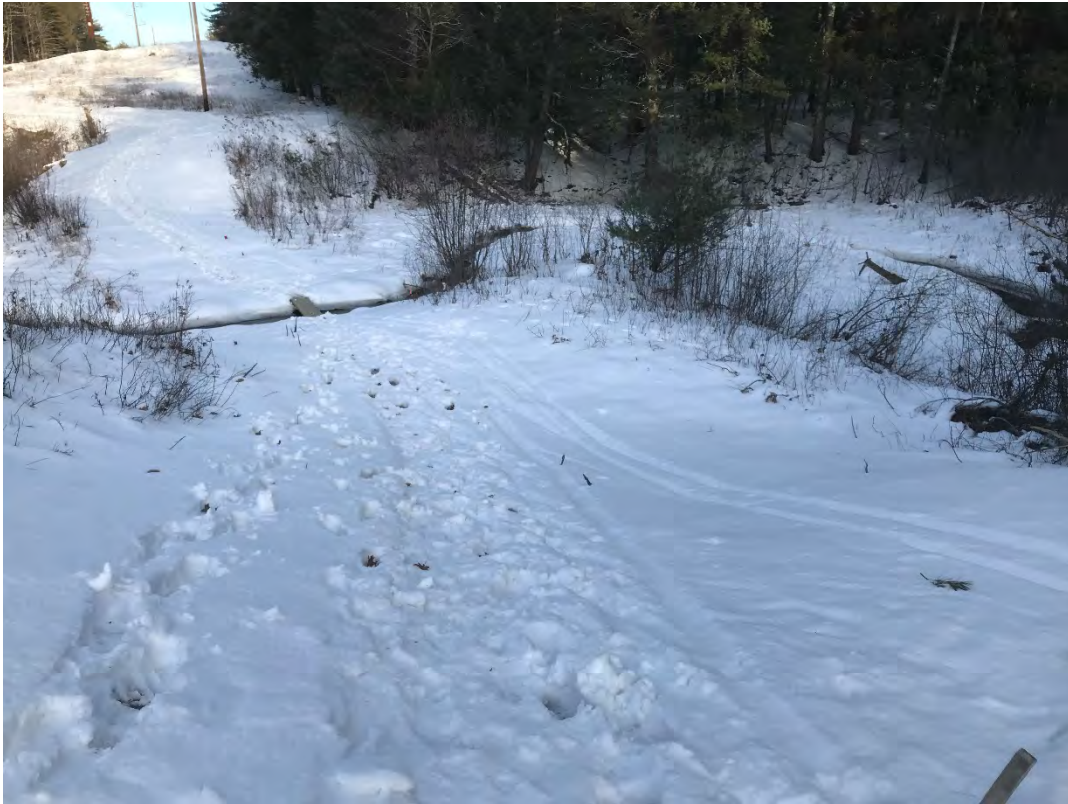
Fig 7: Stream DS46 between Strs. 51 and 52. Viewing northeast. (02-17-21)