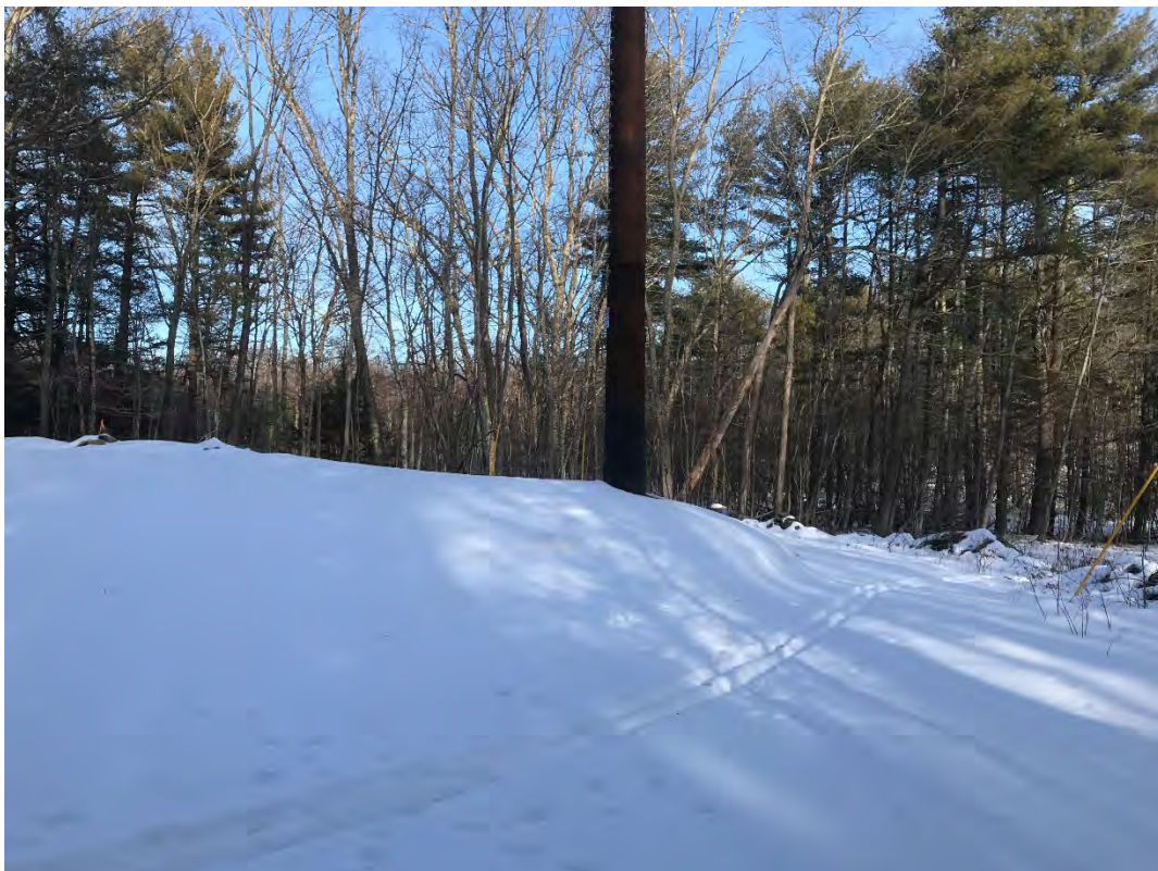
Fig 6: Str. 90 work area. Viewing northeast. (02-17-21)