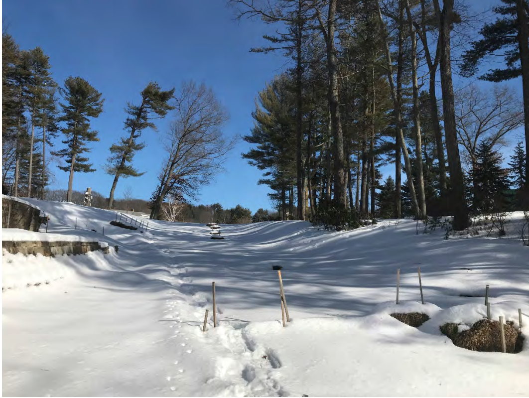
Fig 9: Slope above the manhole at Gundalow Landing/east side of the bay. Viewing east. (02-17-21)