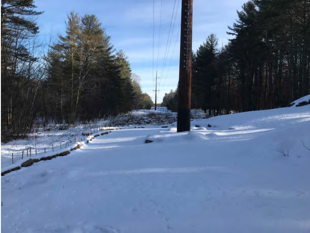
Fig 5: Str. 89 work area. Viewing southeast. (02-17-21)