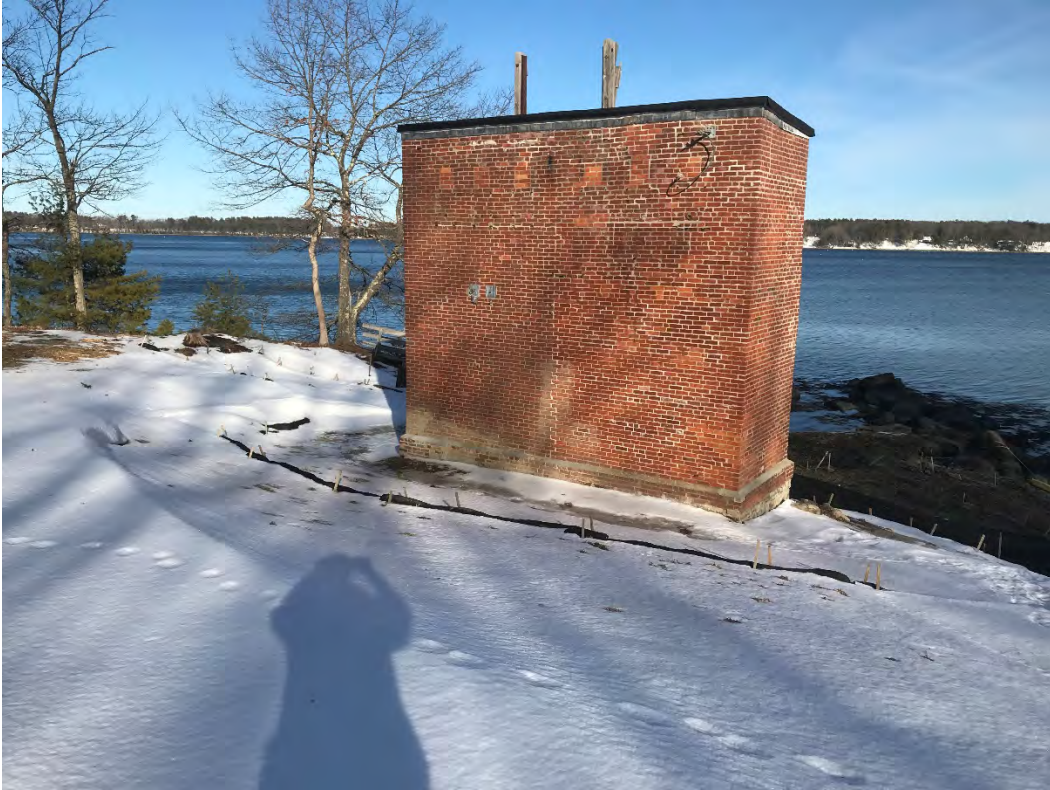
Fig 1: Slope leading down to cable house and salt marsh restoration at the Eversource property/west side of the bay. Viewing northeast. (02-17-21)