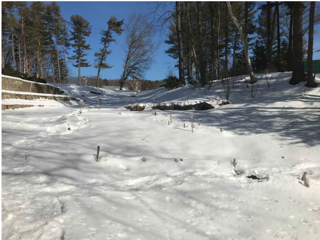
Fig 10: Slope below the manhole at Gundalow Landing/east side of the bay. Viewing east. (02-17-21)